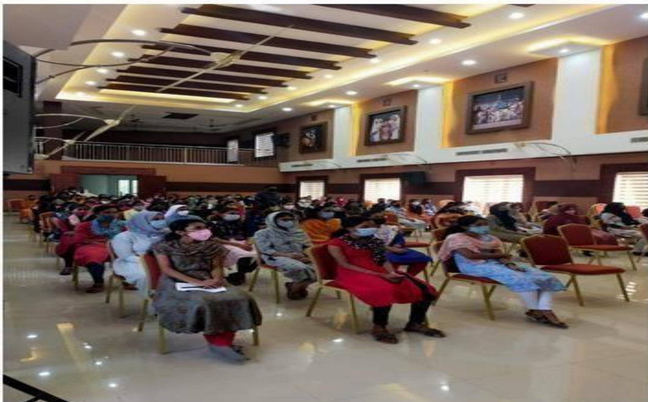
Pic 04: The students of first year B Pharm and Pharm D