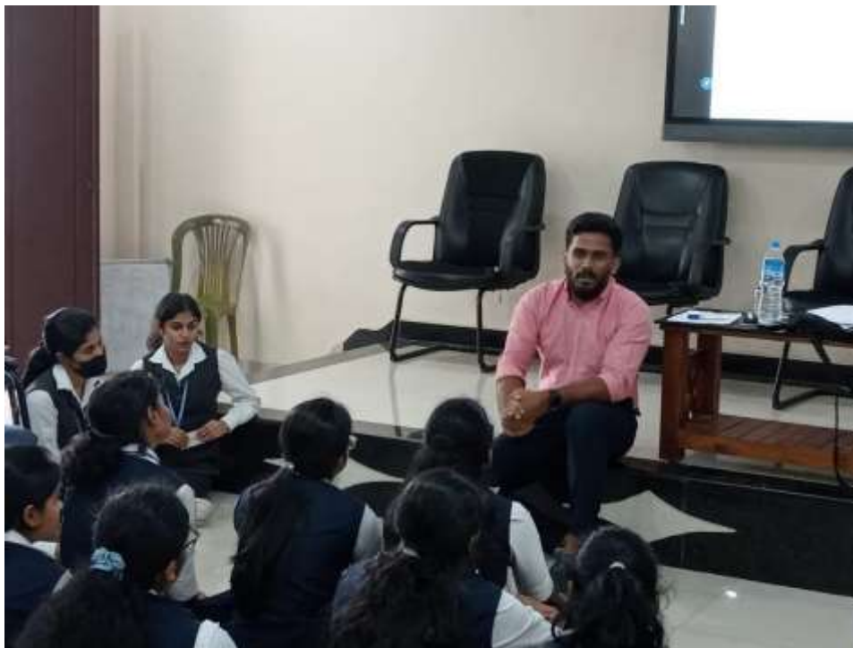
Activity : Ice Breaking