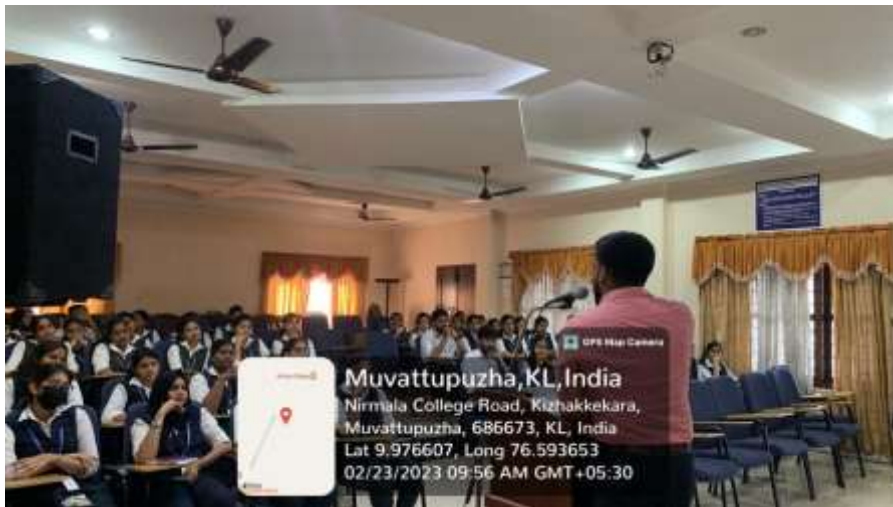
Introduction of Speaker