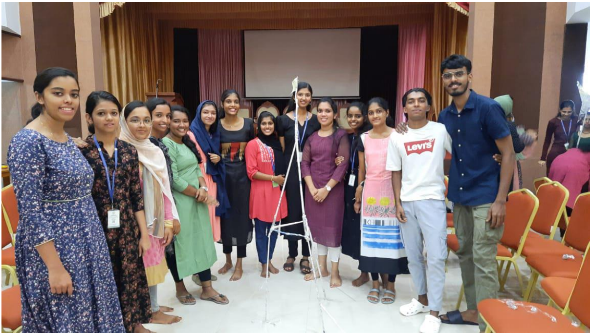
Trainer with students