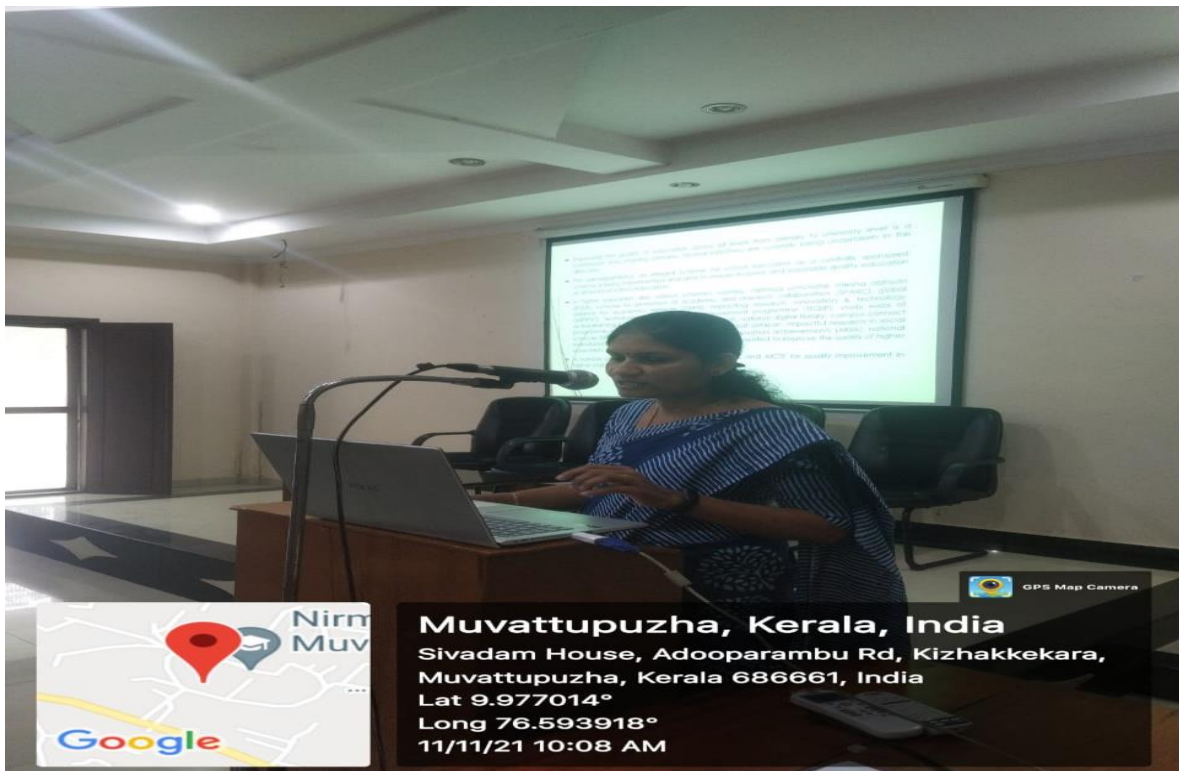
Speakers focus view in Seminar hall