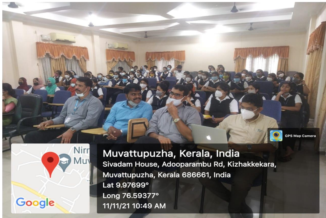
Audience view in Seminar hall