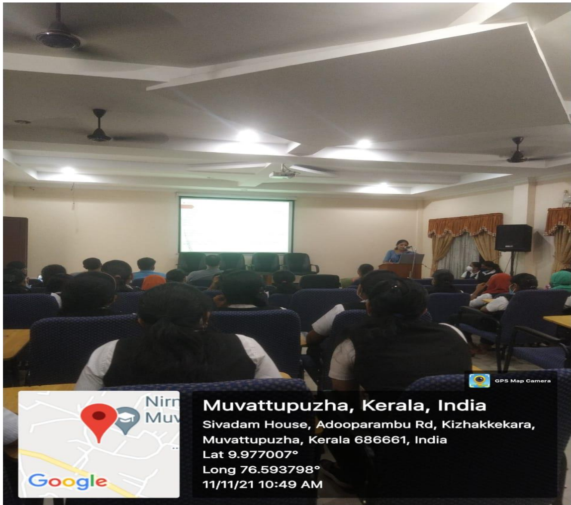
Back to front view in Seminar hall