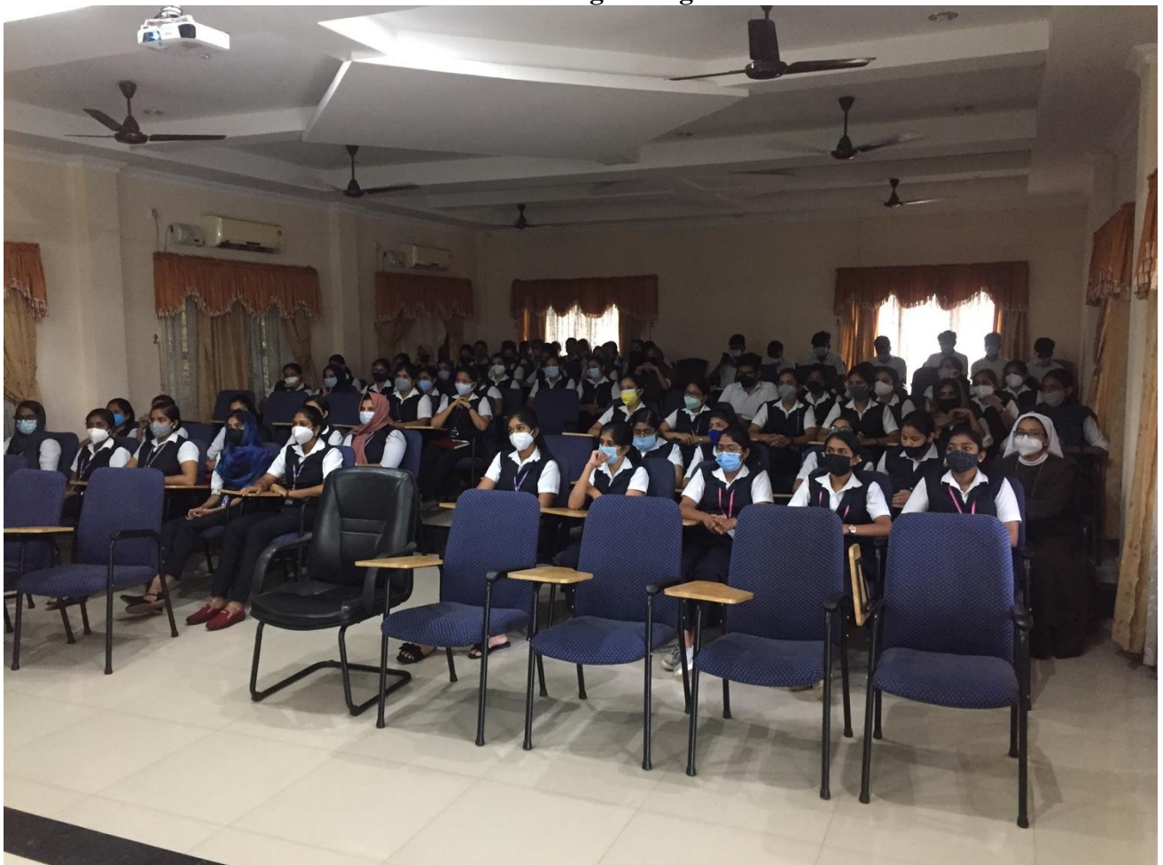
Front view of audience in the seminar hall