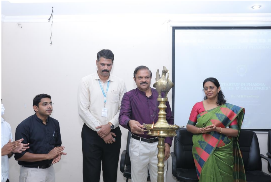
Stage view of the program