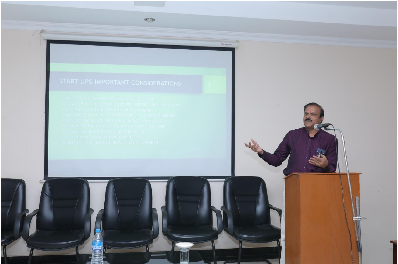
Speakers view of the program